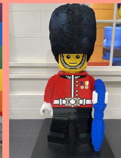
LEGO Store, Leicester Square