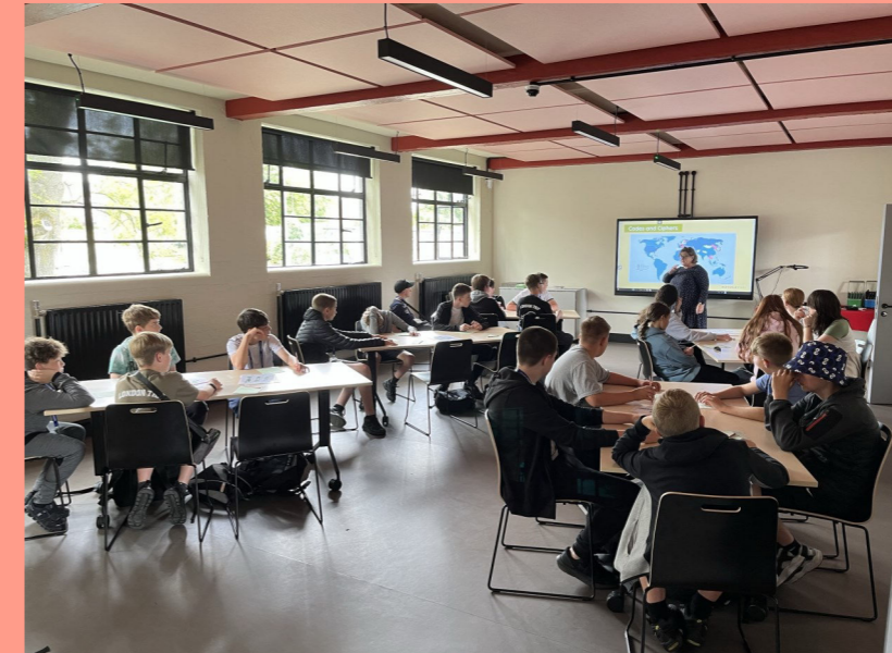
Students at Bletchley Park during a coding workshop.