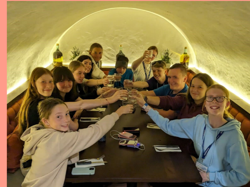
Students at their final meal at Wildwood.